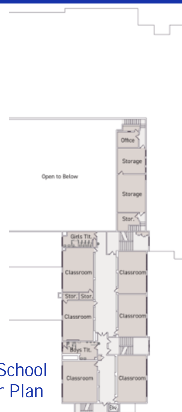
Elementary School Second Floor Plan