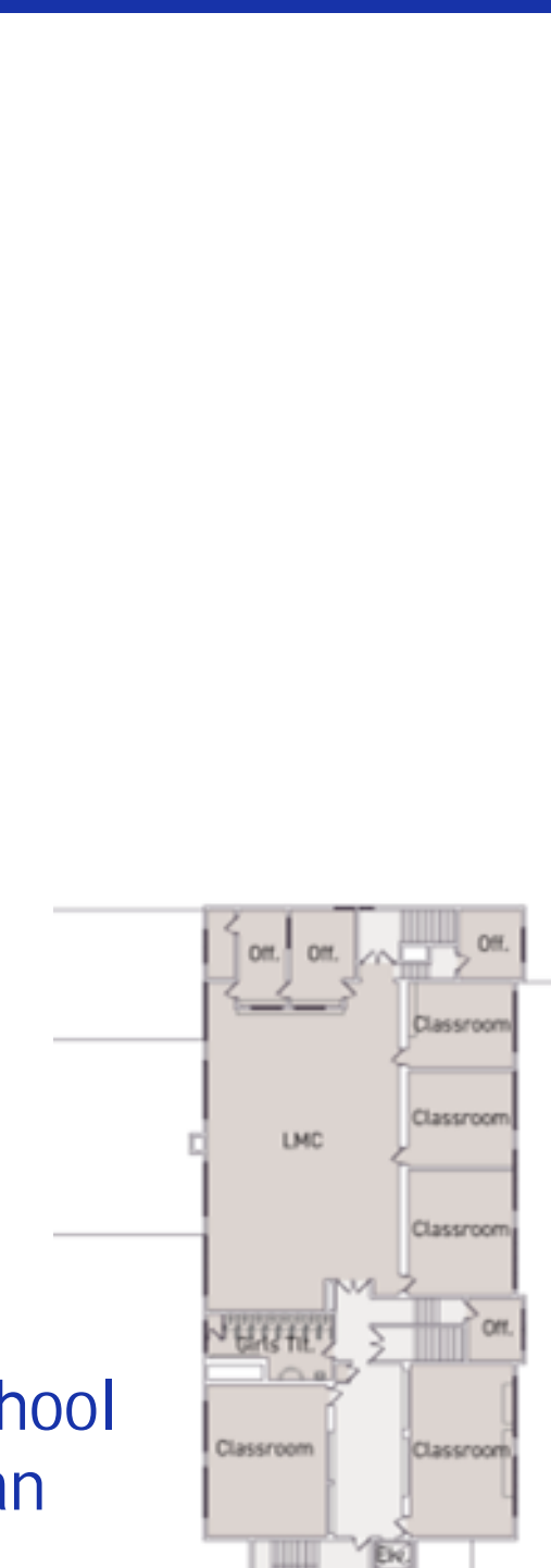
Elementary School Third Floor Plan